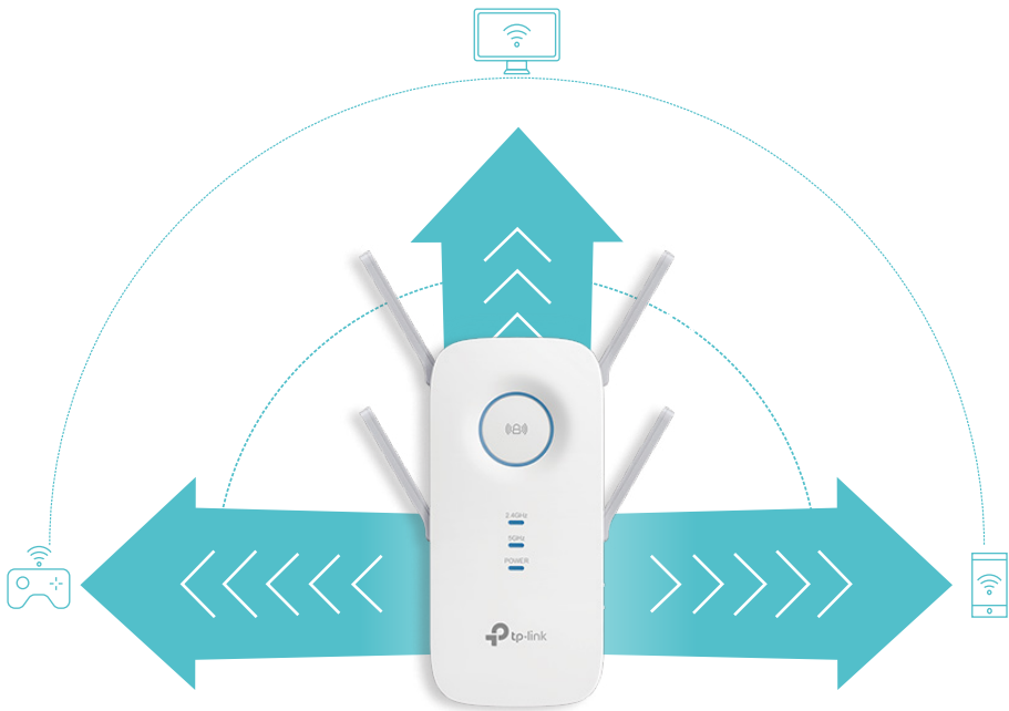
MU-MIMO Range Extender Simultaneously sends data to multiple devices